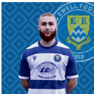
CHESTER CLOTHIER SPONSORED BY: